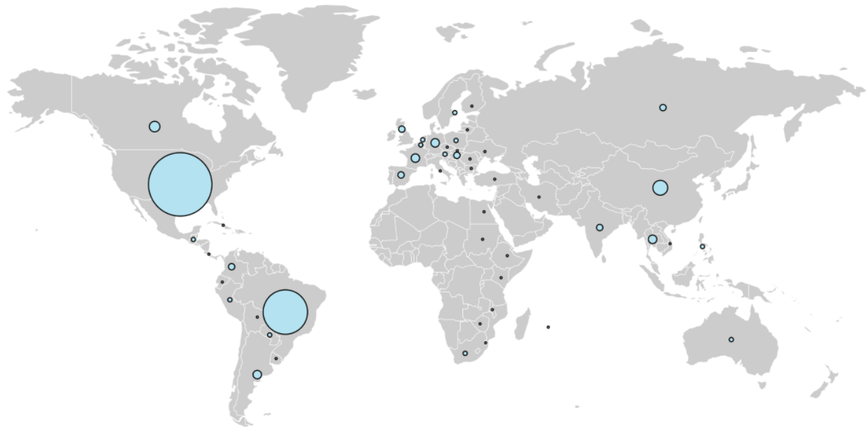
Figure 3: World biofuel production (Statista, 2019). Bubble size indicates volume of ethanol produced.

already contribute towards the global production of biofuels (Figure 3), suggesting that the missing link in this emerging low emissions industry is CCS.